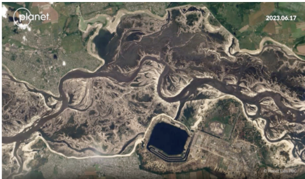
Photo 3: Image of Kakhovka Reservoir and ZNPP with cooling pond June 17, 2023.

The destruction of the Kakhovka Dam exposed a critical gap in both international and national legislation protecting infrastructure essential to nuclear power plant safety.