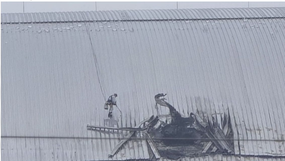
Photo 4: Chernobyl NPP damaged by the drone attack, February 2025.

The rise of drone warfare demonstrates that without urgent investment in legal, technological, and operational safeguards, the safety and security of nuclear power plants can no longer be taken for granted.