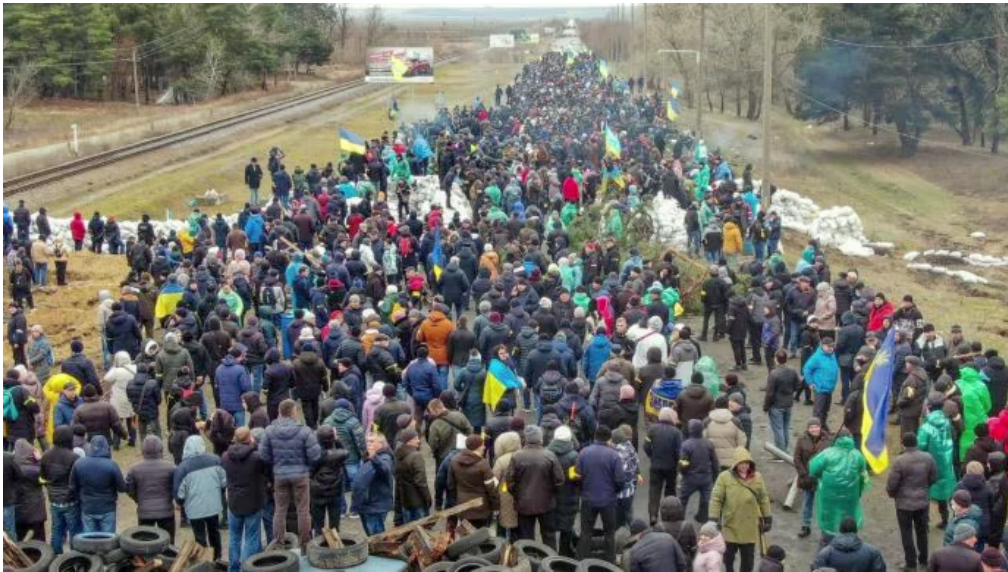
Photo 1. Ukrainian civilians blocking the road to the ZNPP aiming to prevent Russian occupation. Source: Ukrainska Pravda 11

The city of Enerhodar, where the ZNPP is located, was forcibly seized by Russian military forces on 4 March 2022, despite civilian protests [Photo 1]. The Russian army failed to occupy the whole Zaporizhzhia region and as of June 2025, when this document is written. It controls about 70 % of Zaporizhzhia region territory. 10 Thus, the city of Enerhodar and ZNPP remain on the front line [Figure 1].