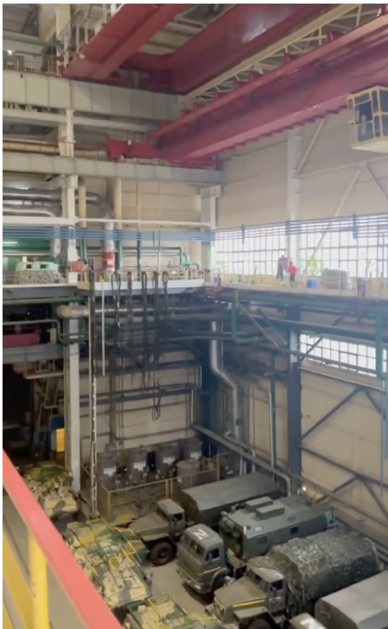
Photo 2. The repair site of Unit 4 ZNPP filled with military equipment, including armored personnel carriers and other large military vehicles. Originally published by the Russian military, March 2024. 40